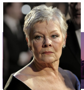
Dame Judi Dench